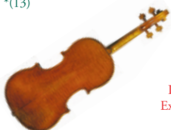
Front Cover Lord Amherst Stradivarius (1734) Ex Jacques Gordon, Ex Fritz Kreisler

For yourself or as a gift. Mix or Match any $30 or $35 tickets. $100 for 4 tickets $200 for 8 tickets $300 for 12 tickets $400 for 20 tickets Must be purchased by Saturday, June 16, 2012.