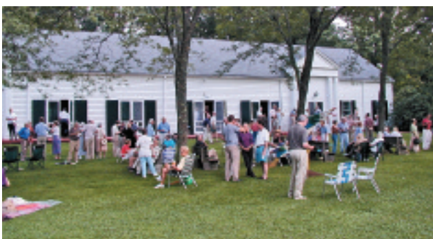
Gordon Hall at Music Mountain

WELCOME Music Mountain, with its focus on the string quartet literature, is in a beautiful and inspiring setting. It remains the premiere destination in the United States for intimate chamber music concerts.